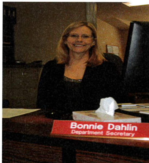
Office Manager/Board Clerk